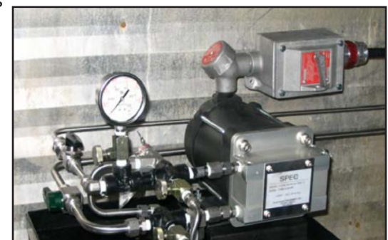
Engineered for superior chemical resistance and durability