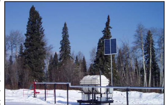
SPEC Injection skid for methanol applications (with stainless pumps)